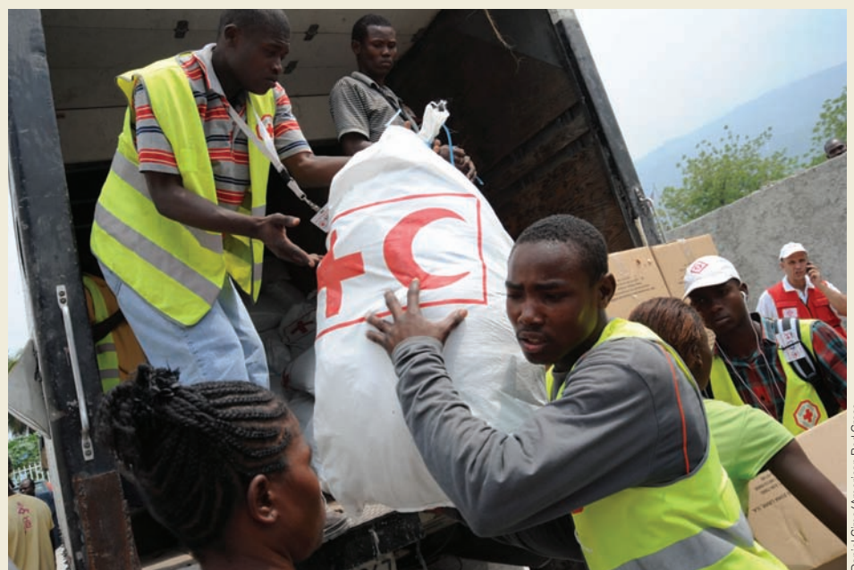
Red Cross volunteers unload and distribute rice bags full of relief items for families now living in settlements near Centreville, a neighborhood in Port-au-Prince.

The American Red Cross has provided 43 percent of the items distributed by the global Red Cross network in Haiti.