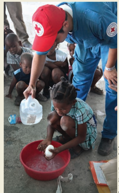
Red Cross volunteers share health and hygiene messages with young earthquake survivors in Carrefour.

Red Cross teams are also finding innovative ways to communicate health and hygiene information, including through street theater and free text messages via mobile phones that advise survivors how to stay safe in difficult living conditions. To date, outreach